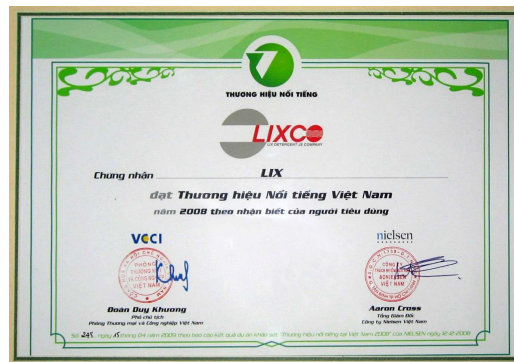
Vietnam Famous brand 2008