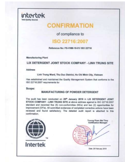
ISO 22716: 2007