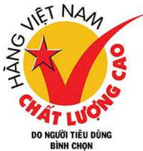
Vietnam High Quality Goods Since 2006