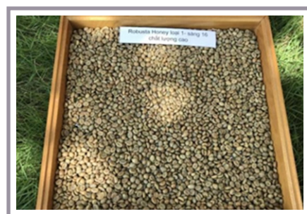
HONEY ROBUSTA Type 1/ Size 16 (15+)