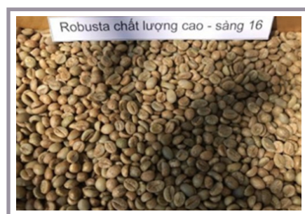
PREMIUM ROBUSTA Type 1/ Size 16 (15+)