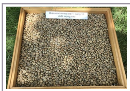
HONEY ROBUSTA Type 1/ Size 18