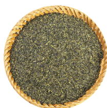
GREEN TEA BPS