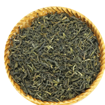
GREEN TEA OP