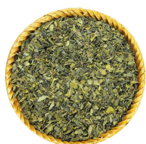
GREEN TEA TH