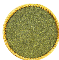
GREEN TEA FANNINGS