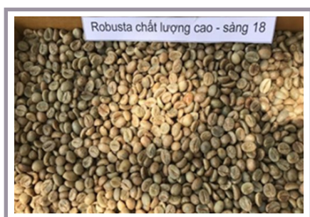
PREMIUM ROBUSTA Type 1/ Size 18