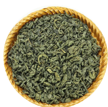
GREEN TEA SUPER PEKOE