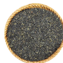
SPECIAL VIETNAMESE GREEN TEA