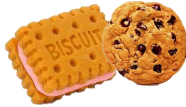
BISCUITS & COOKIES