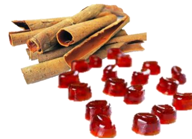
HERBAL LEZENGES & NUTRITION