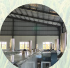
Drying and Cutting